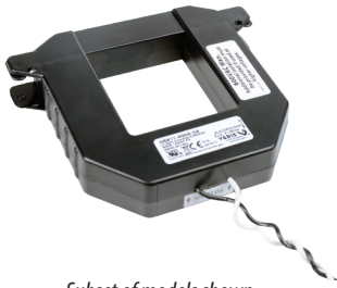
Subset of models shown.